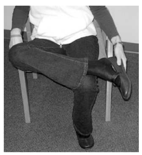
Figure 3 - recommended shoe donning position (right hip)

Remember, this is a safe position for your hip replacement and is recommended after hip replacement surgery.